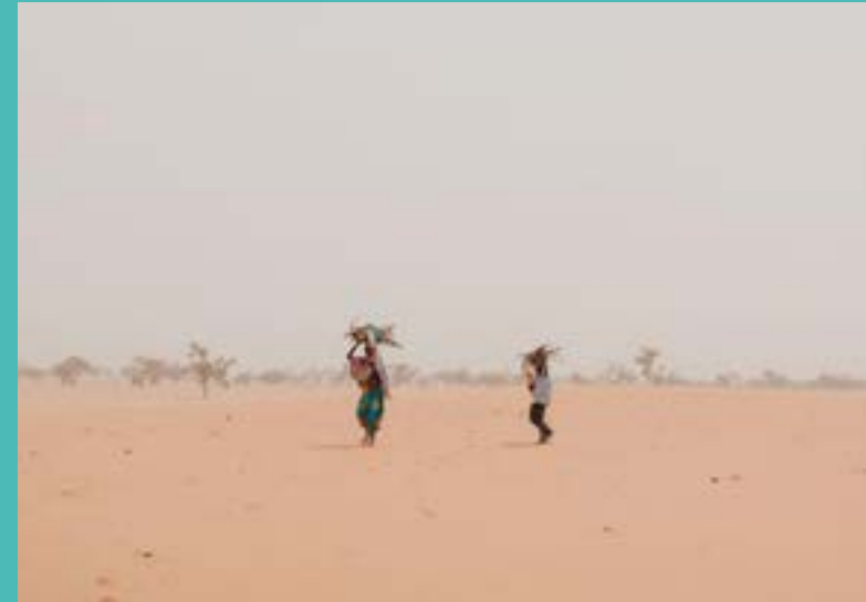
Desertification in Africa, a major challenge for health systems.

France is committed to developing prevention and promotion strategies and programmes in the health sector that focus on the determinants of health. France will also work to develop healthcare pathways that guarantee appropriate care at all ages. It maintains strong commitment to fighting infectious diseases and antimicrobial resistance under the One Health approach.